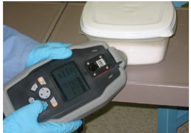
Figure 3. Ahura's First Defender is used to identify ammonium nitrate contained in a food container.